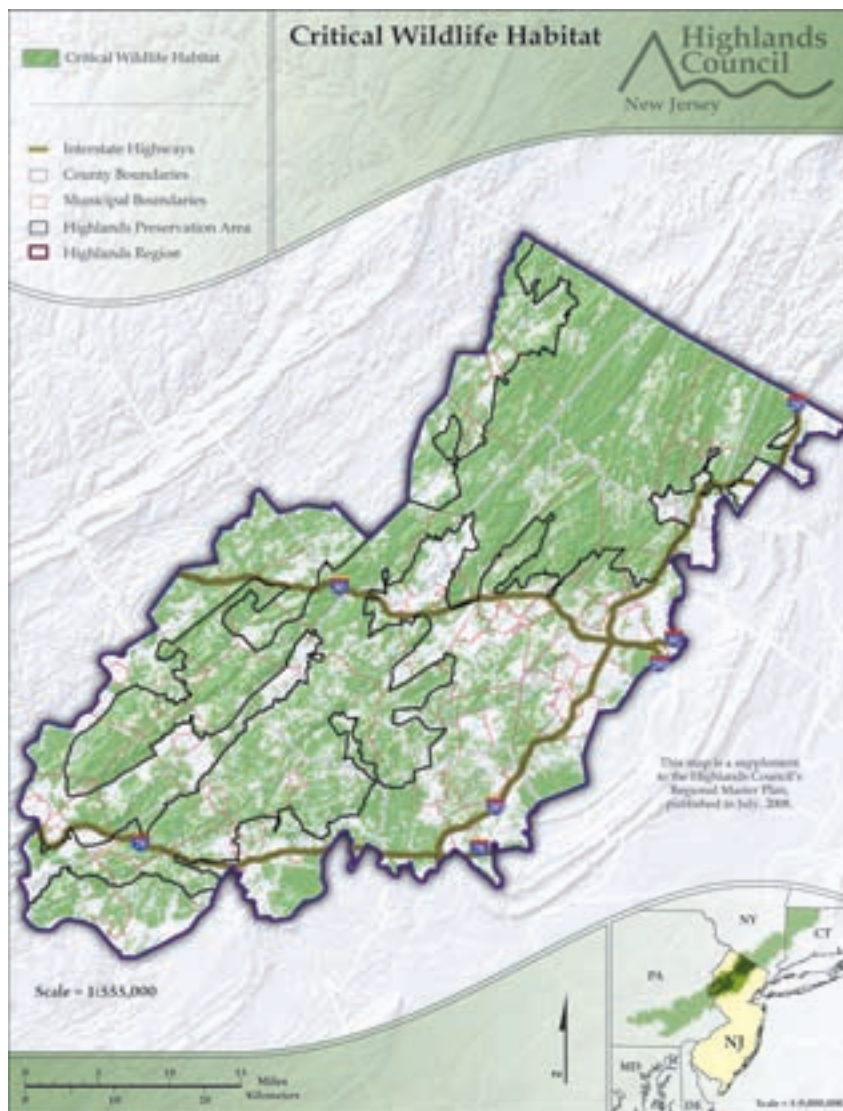
Figure 1 One of the many maps accessible through the New Jersey Highland Council's website. Visit http://www.highlands.state.nj.us/ .

already defined by a local government as land worth conserving, the property owner that donates the property will then qualify for state tax incentives for conservation purposes. If the property is not previously designated as important to conserve, the property owner will have to demonstrate the conservation value by other means. This incentivizes both local government and conservation organizations to designate property in the comprehensive plan as important conservation property. For more information visit http://dcr.vi.virginia.gov/land_conservation/lpc.shtml .